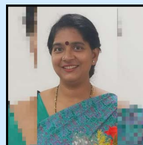
Co editor : Purnima Govind (PRT)